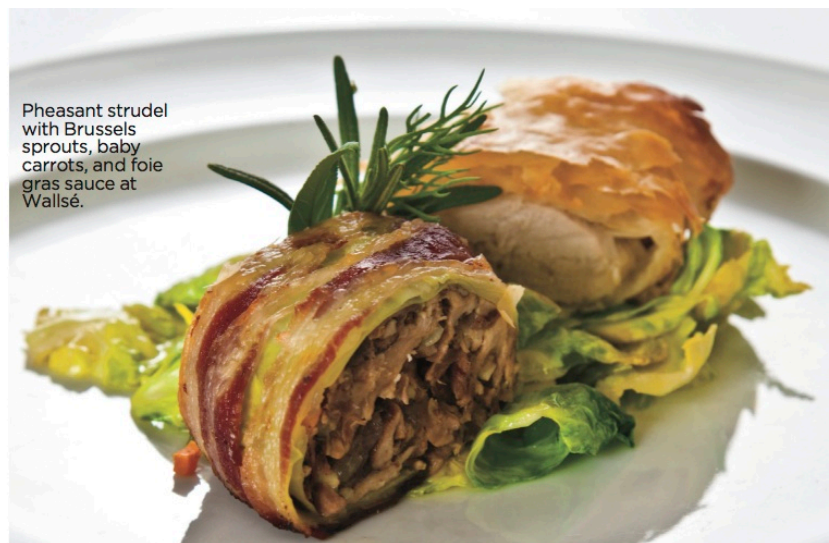
Pheasant strudel with Brussels sprouts, baby carrots, and foie gras sauce at Wallsé.

344 W. 11th St., 212-352-2300; kg-ny.com/wallse G